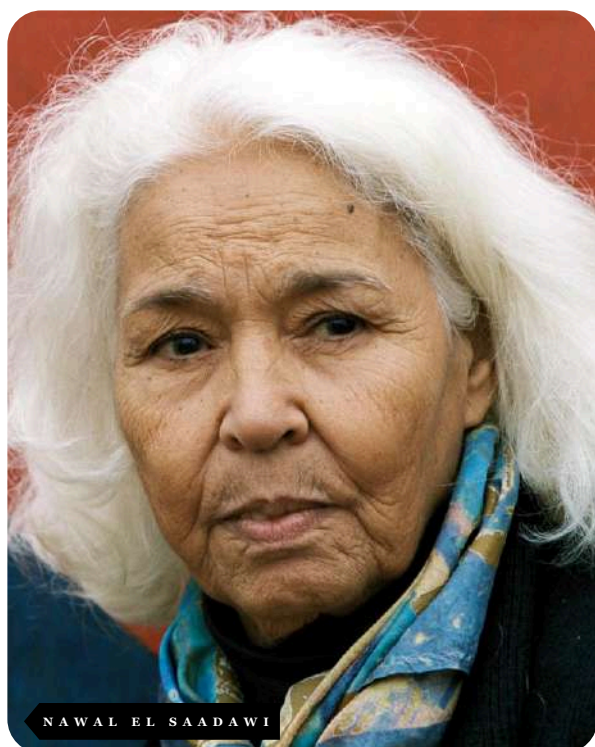
NAWAL EL SAADAWI

Overtime, we have kept updating the title of this section, first to Honouring our elders then later on to Honouring our elders: Conversations with the Living-Dead. [5]