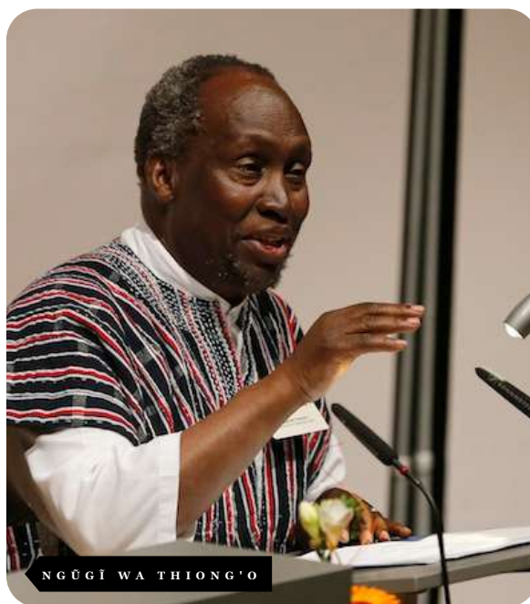
NGŨGĨ WA THIONG'O

This Section Call for contributions proposes focusing on five major figures whose intellectual contributions are essential in understanding modern African law and politics. This will inevitably ensure the sustenance of an Afrocentric perspective in such an intellectual heritage. The figures comprise but are not limited to Wangari Maathai, Doudou Thiam, Amílcar Cabral, Nawal El Saadawi and Ngũgĩ wa Thiong'o. The submissions should critically analyse how these scholars' works contribute to contemporary debates in African studies. Comparative, interdisciplinary, feminist, or contemporary reinterpretations of their ideas are highly encouraged.